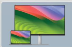
Match your Mac Colors