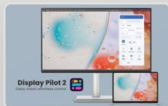
Mac-like User Interface