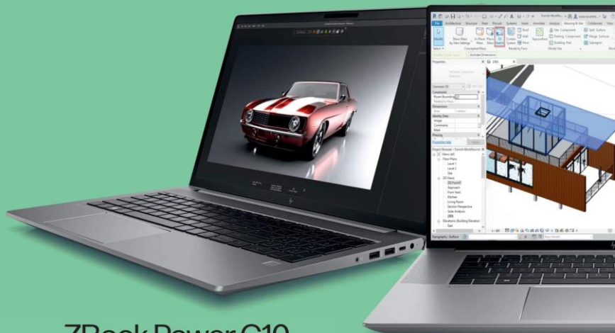
ZBook Power G10 8F8Y9PA