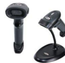
1D/2D Barcode Scanners